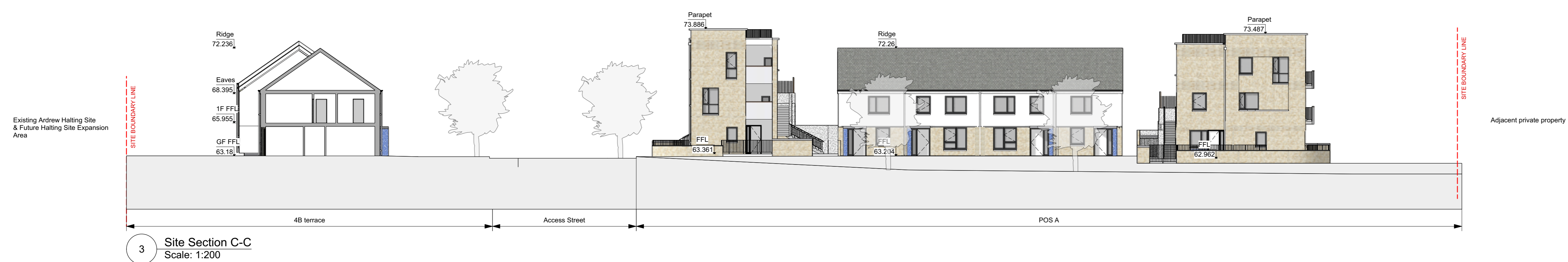
3 Site Section C-C Scale: 1:200

Note: for boundary treatments along all site boundaries shown, refer to drawing SHB3-ATY-AR-COA-DR-014